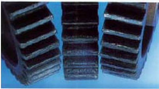
Heat Damage (burnt) Replace Gear set

Initial pitting may be considered normal gear wear. For assistance in identifying acceptable gear pitting please contact the RoadRanger Call Center at 1-800-826-4357