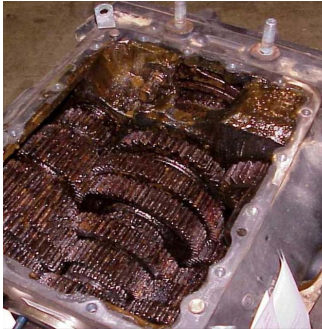
Transmission with tar build up (Recommendation Transmission replacement)